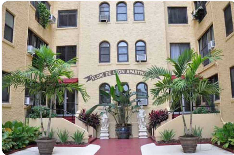
Flori de Leon Apartments