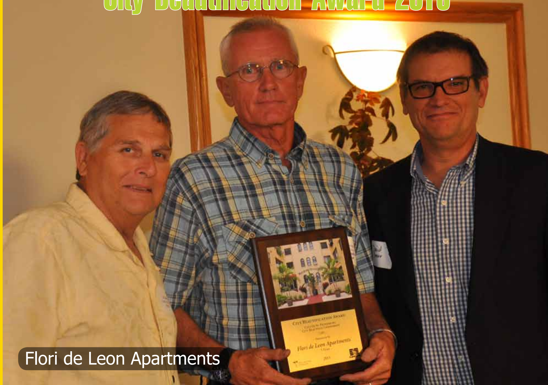
Flori de Leon Apartments